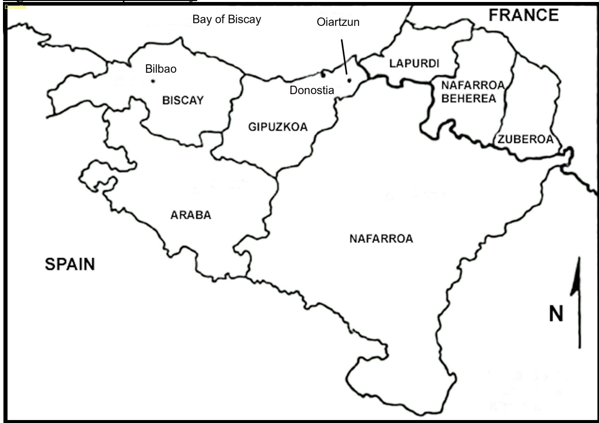
Figure 1: The Basque Country