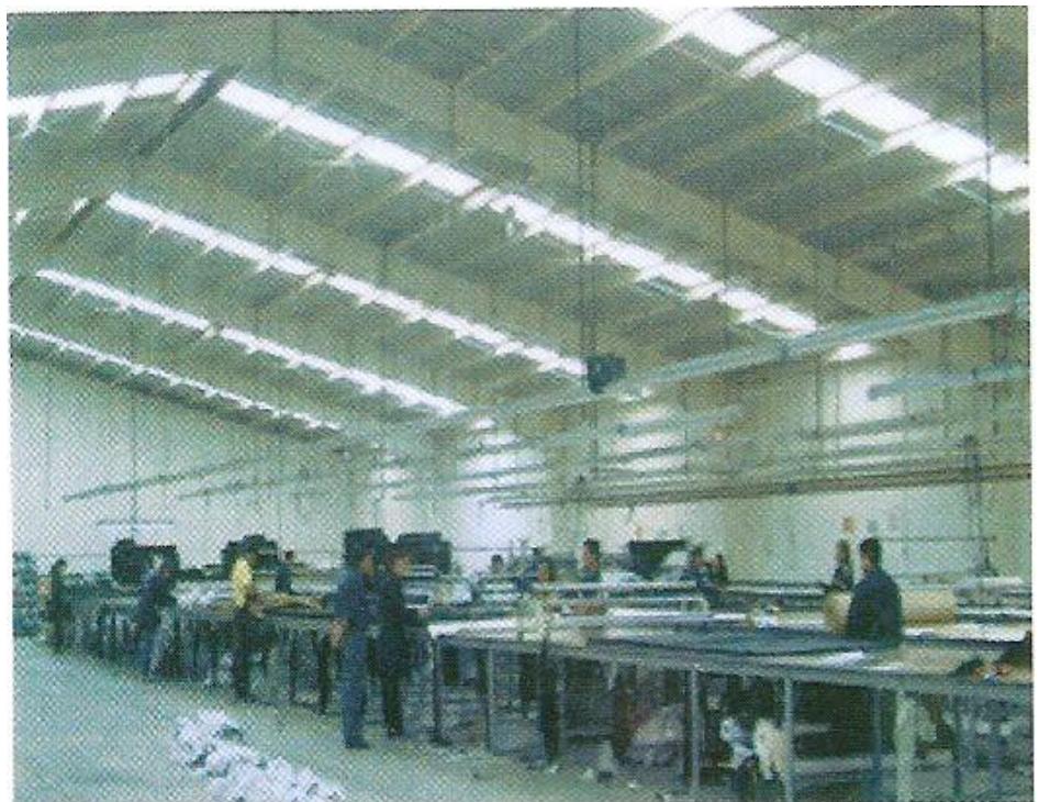
Cutting Room in Toluca, Mexico

Sourcing is the process where apparel and retail companies develop their strategies to produce a product. This course explains the role of sourcing in the apparel industry. The practices and principals of sourcing are critical to the success of a product. It is complex and has many elements to consider before a successful plan can be implemented. This class will include in depth case studies with product research from countries around the world.