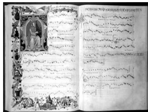
The beautifully illuminated Squarcialupi Codex