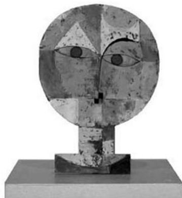
Allusion , Sills