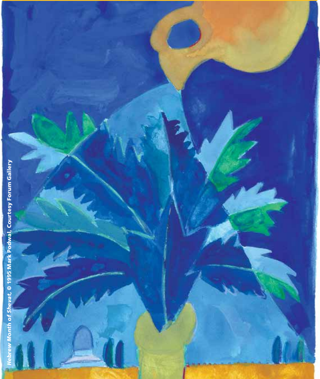
Hebrew Month of Shevat, © 1995 Mark Podwal