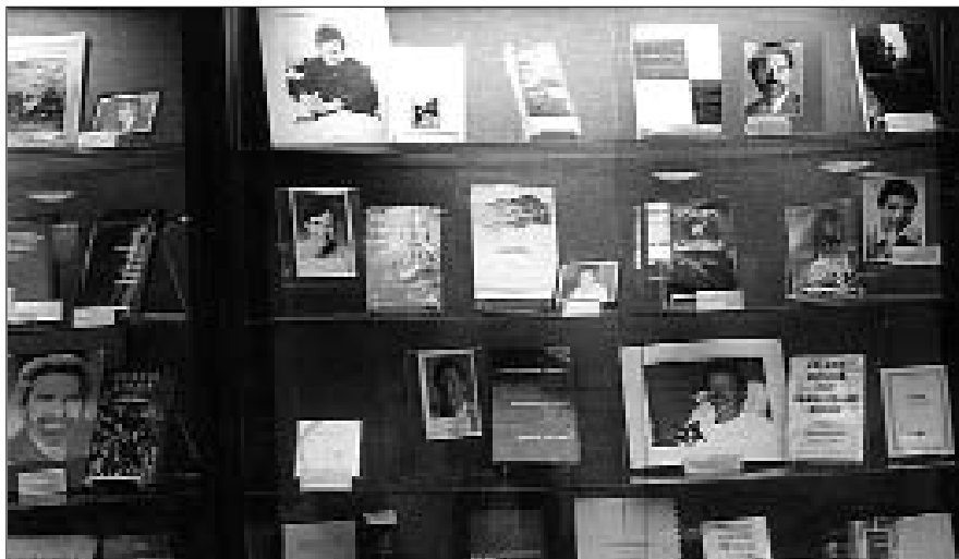
EXHIBIT SHOWCASES FACULTY PUBLICATIONS