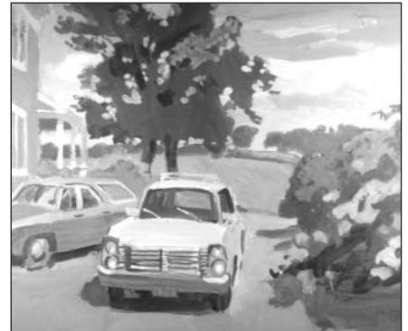
Landscape with Two Parked Cars, Fairfield Porter, oil on canvas, 1972

An ambassador of Queens College will be on the road during this academic year and well into 2003/2004. It is a painting by the great American realist Fairfield Porter (1907-1975), normally on display on the Library's third floor. Landscape with Two Parked Cars was included in the exhibition Fairfield Porter: A Life in Art presented in 2000 by the Equitable Gallery in New York, and was seen there by thousands of visitors. Because of the great critical and public response, the Library is now lending the painting to a tour of the exhibition. From October 5 to January 5, it will be shown at the Frye Art Museum in Seattle, Washington, and from there it will travel to the Montgomery Museum of Fine Arts in Montgomery, Alabama, the Portland Museum of Art in Portland, Maine, and the McNay Art Museum in San Antonio, Texas, where it will close in December 2003. The exhibition's catalog, by Justin Spring, is available in the Art Library: N6537.P63 S66 2000.