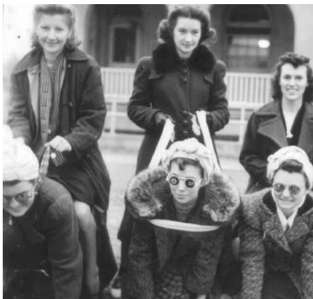
"Hell Week, 1939"

On display are a variety of original photographs and excellent quality photographic computer scans (from the Publications Department) and original and copy publications, including books, student magazines, flyers, newspapers and clippings, College and pre-CUNY pamphlets, as well as Presidential Correspondence